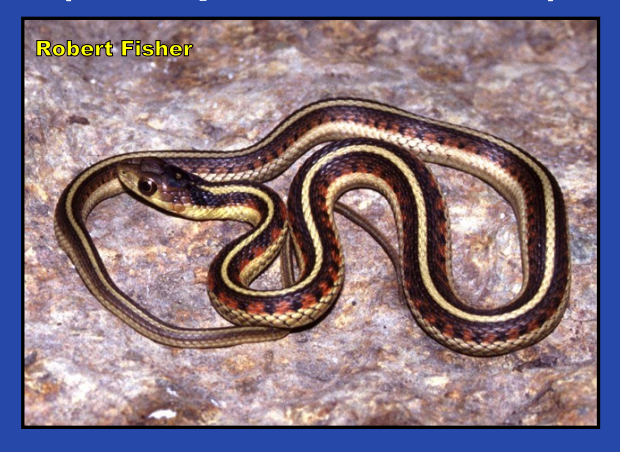
Long-nosed Snake (Rhinocheilus lecontei)