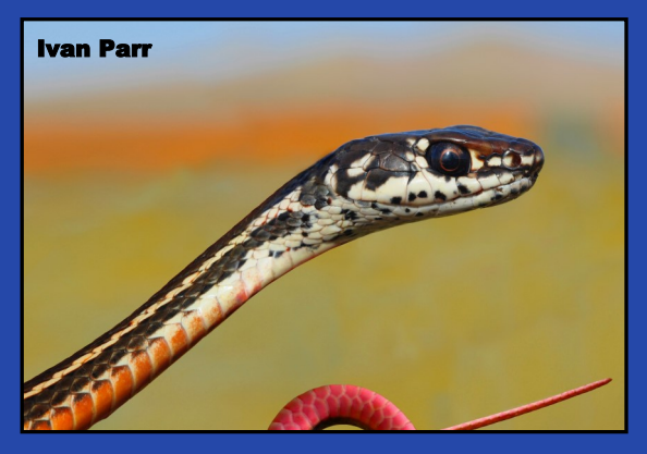
Monterey Ring-necked Snake (Diadophis punctatus vandenburghii)