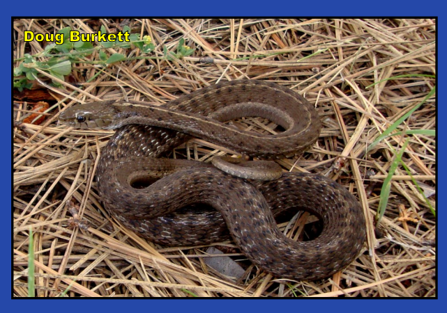
Two-striped Gartersnake ( Thamnophis hammondii )